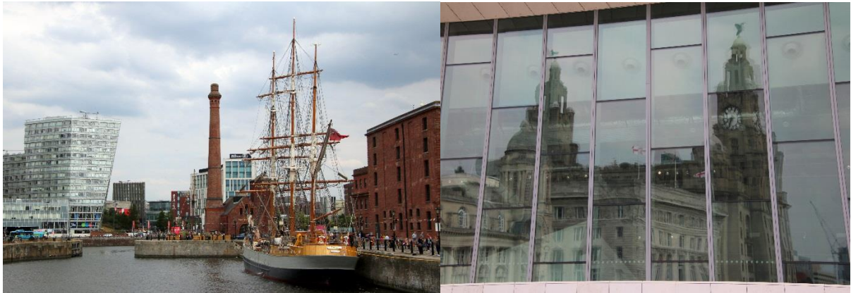
Trip to Liverpool and Terracotta Army exhibition Wednesday 11 th July, 2018