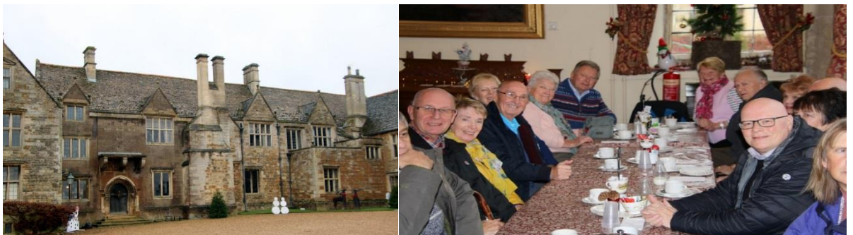
Trip to Rockingham Castle and Lunch – 28 th November, 2018.