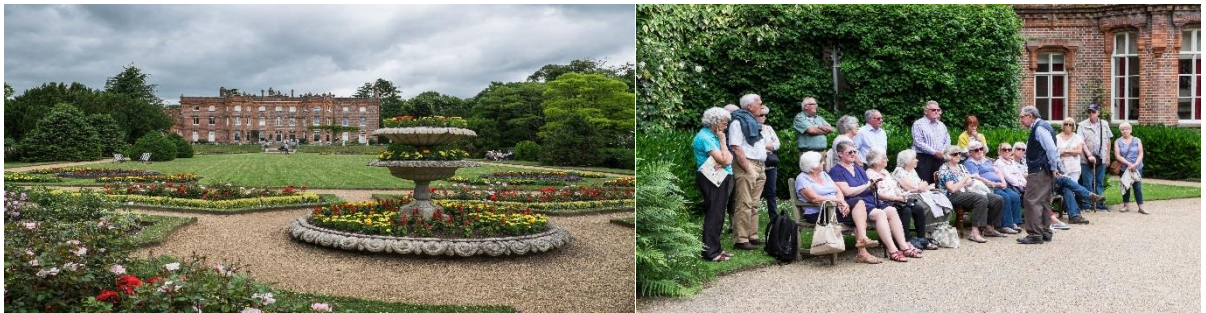
Trip to Hughenden Manor 20 th June, 2018