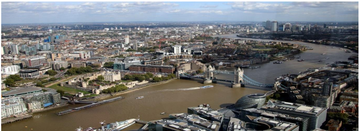
Trip to London – 15 th September, 2018 - Members did their own things. View from The Shard.