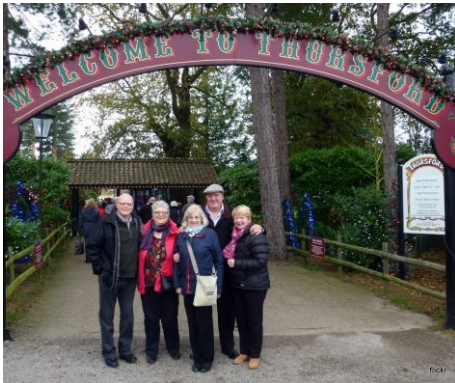
NARPO trip to Thursford Christmas Spectacular