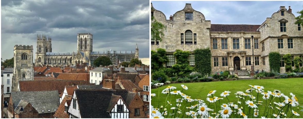
York Minster taken from the Marks and Spencers Café. Treasurers House – National Trust